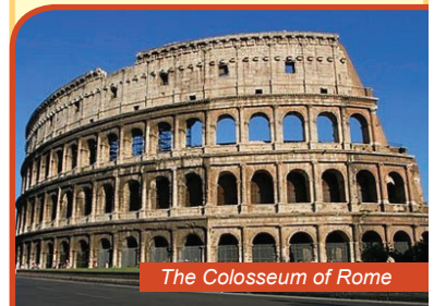
The Colosseum of Rome